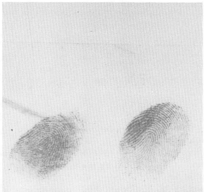
DEVELOPED IN LAB