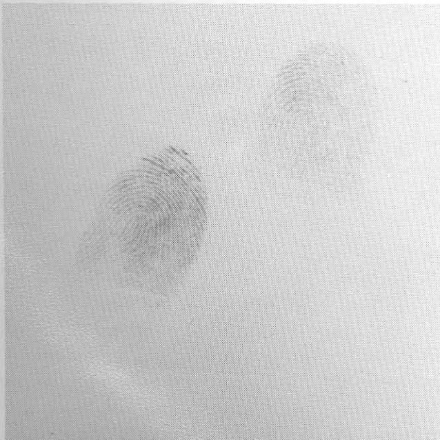
DEVELOPED IN LAB