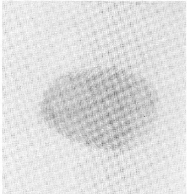
DEVELOPED IN LAB