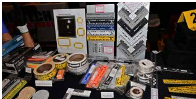
Exhibit booths will be ready for occupancy: Sunday, October 20, 2024 at 12:00 pm. All materials must be removed and prepared for shipping from the booths by Wednesday, October 23, 2024 no later than 4:00 pm.